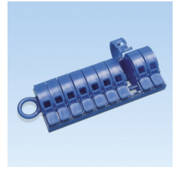
PM D EMPTY DISPENSER