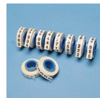
PMDR - * - *